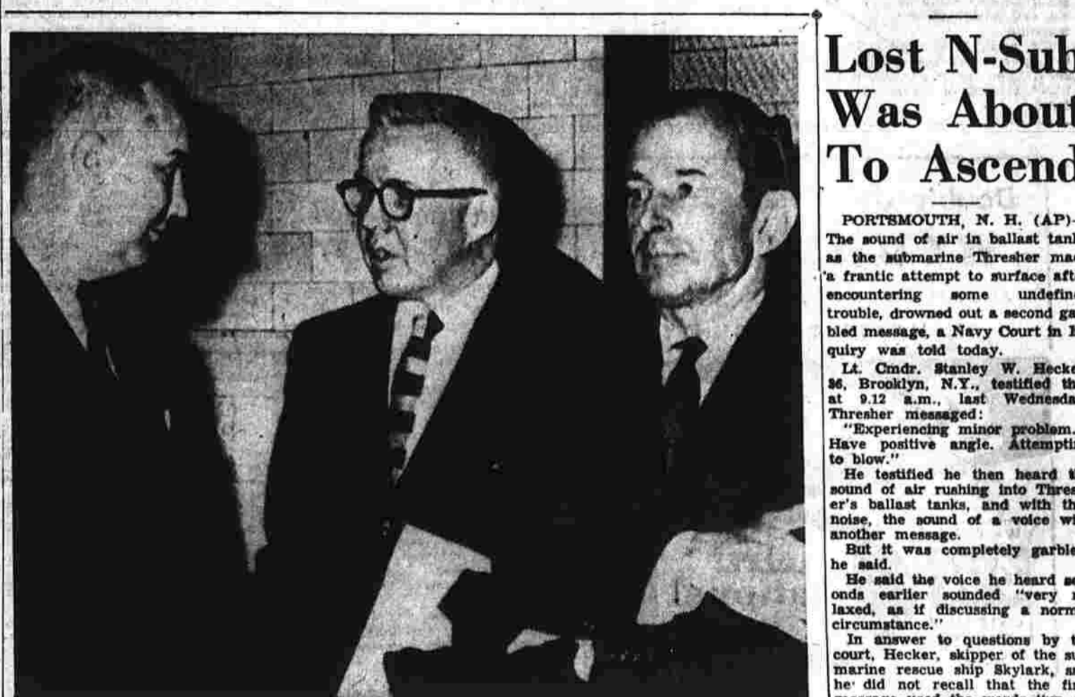
Newspapermen Appeal Contempt Convictions. Two Philadelphia Bulletin newspaper executives confer with their attorney in Philadelphia court at City Hall before being sentenced to five days in jail and fined $1,000 each on contempt charges.